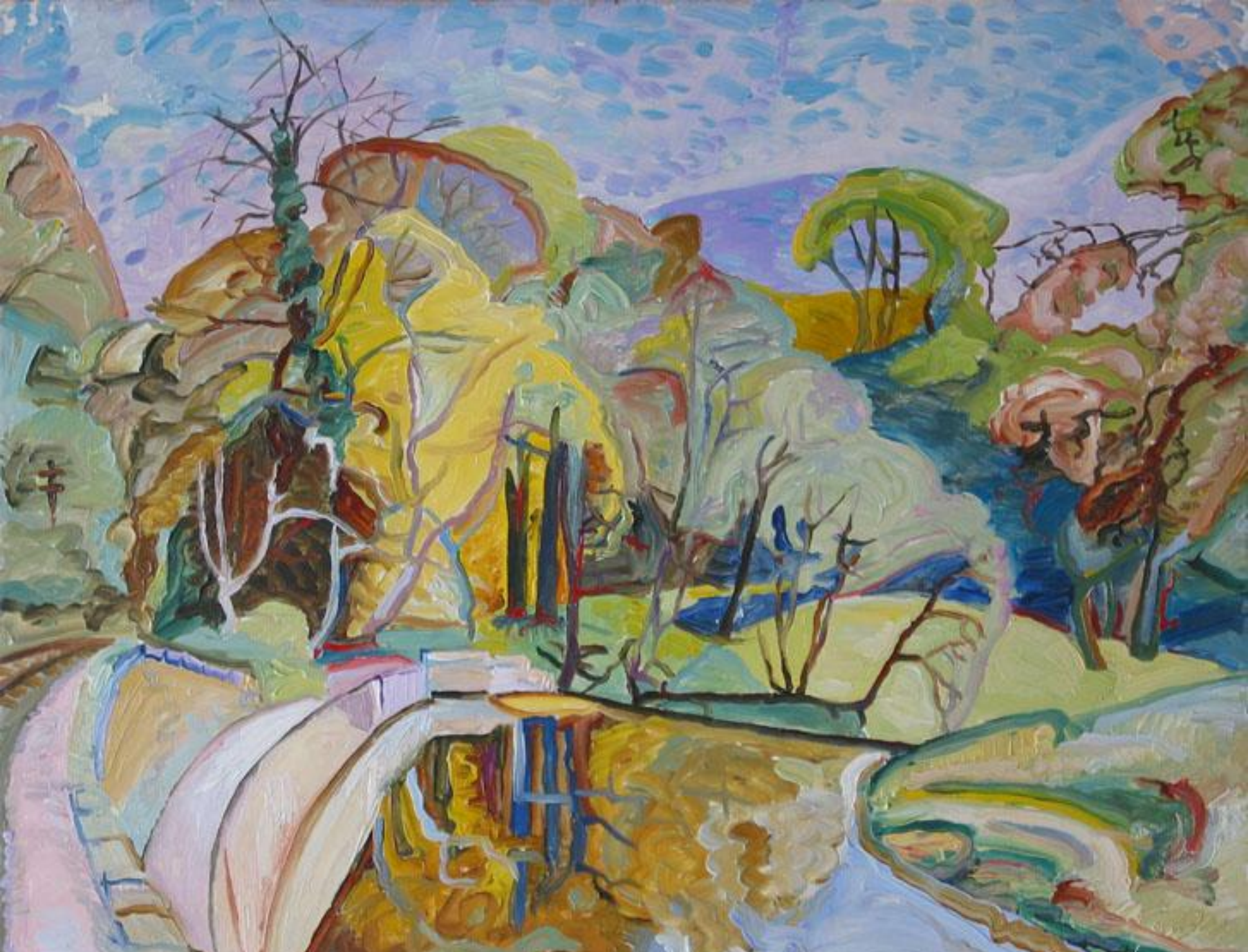
Flour Mill Dam, Juniper Green; 1946