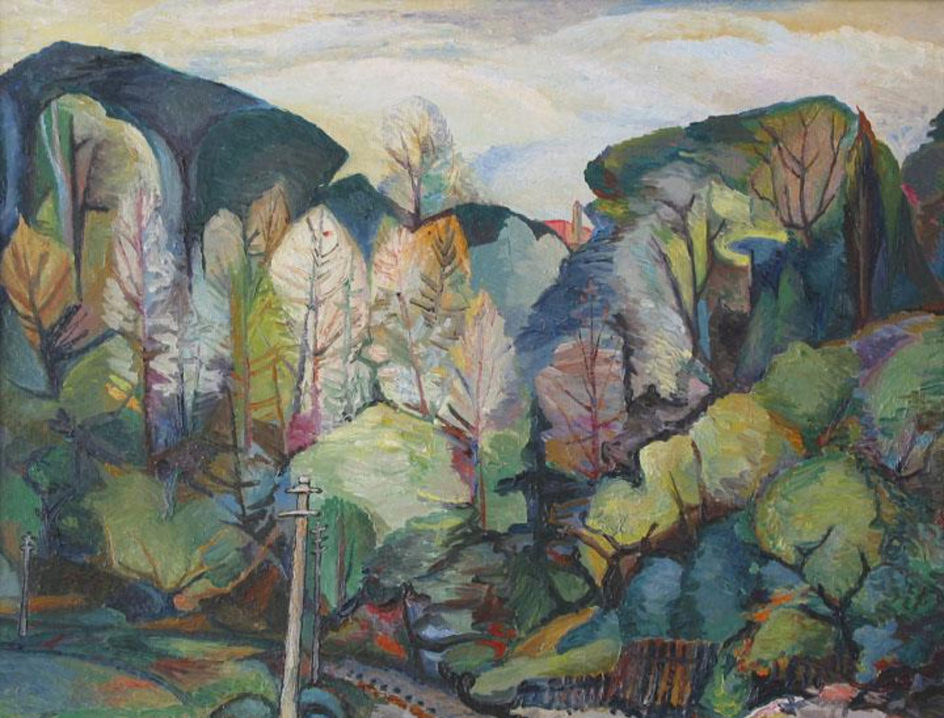
Railway at Hailes Halt, Kingsknowe