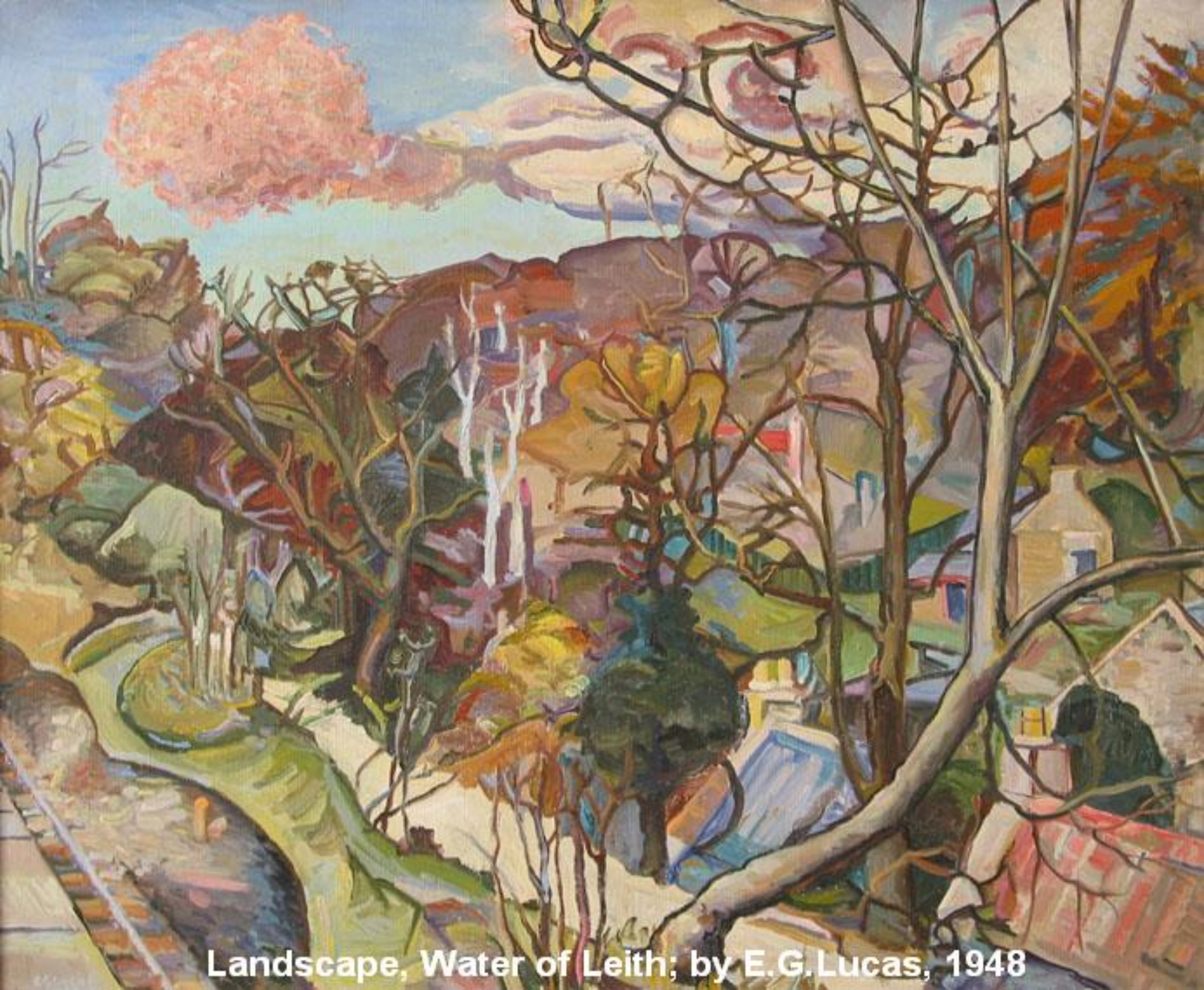
Landscape, Water of Leith; by E.G.Lucas, 1948